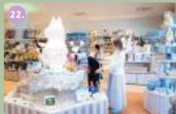
22. Main shop Moominvalley Muumilaakso kauppa The biggest shop in Moominvalley Park with some of the goods only available here.