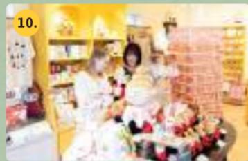
10. Little My's shop Pikku Myy kauppa A shop dedicated to Little My.