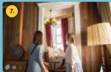
7. Moominhouse Muumitalo The house where the Moomins live. Its rooms are full of wonderful details!