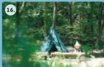
16. Snufkin's tent Nuuskamuikkusenttelä Snufkin, who loves to travel, lives here. You never know when he might come back.