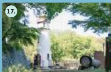
17. Lighthouse Majakka A place where the Moomins temporarily lived. Moominmamma's paintings decorate the wall of the lighthouse.