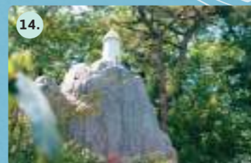
14. Observatory Observatorio The place where Moomin, Sniff and Snufkin were headed on their big adventure.