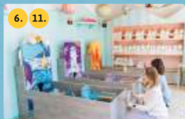
6. 11. Arcade games Peli&Leikki Tahmatassu kauppa Two different games with delightful prizes! (1 play / ¥700)