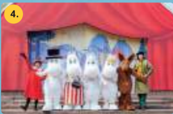
4. Emma's Theatre Emma teatteri See the Moomin characters performing live on stage.