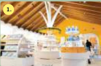
1. Entrance shop Alku kauppa Find the perfect items to accompany your visit and to take home as souvenirs!