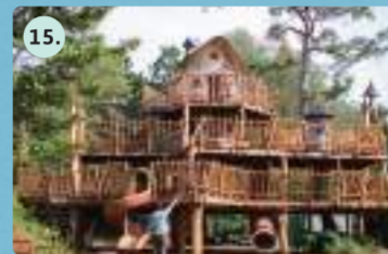
15. Hemulen's playground Hemulin leikkipaikka A big tree house on top of the Lonely Mountain.