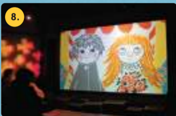
8. Theatre of Moominvalley Muumilaakso Teatteri Watch animated Moomin stories in this theatre.