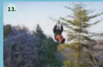
13. Hobgoblin's zipline Taikurin seikkailupaikka Hop on and slide from the top of the Lonely Mountain over the lake! (1 round ¥3,000 / operating only on weekends and holidays)