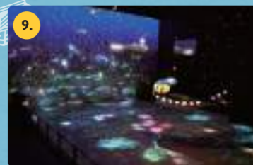
9. Oshun Oxta Merenhuiske Go on a thrilling adventure with Moominpappa in this one-of-a-kind morphing theatre! (Duration ~ 15 min)